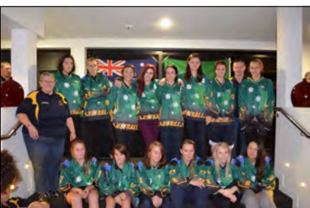
Veterans: (7-5)(5OT-4)(4-2)(2-0)(5-1) NZ