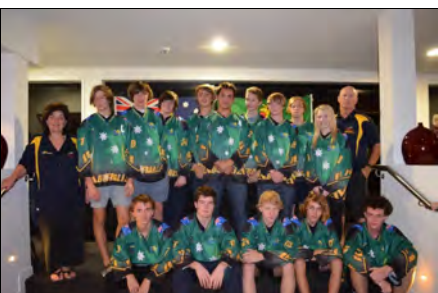
Junior Women; (2-1)(1-0)(3-1)(3-4)(4-1) NZ