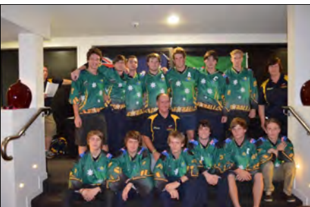
12 & Under Grade; (4-2)(3-4)(3-1)(3-2)(3-1) NZ

following results. Congratulations to all the competed.