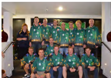
14 & Under Grade; (3-6)(3-4)(3-1)(3-2)(1-5) AUS