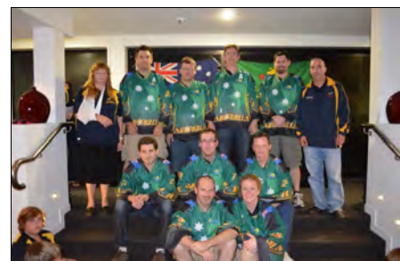
16 & Under Grade; (2-5)(0-2)(2-4)(1-3)(1-5) AUS