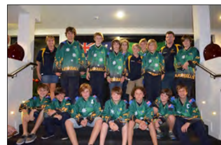
21 & Under Grade; (4-1)(4-0)(2-5)(3-2)(3OT-2) NZ