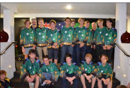
18 & Under Grade: (3-2)(6-2)(4-1)(4-5)(5-2) NZ