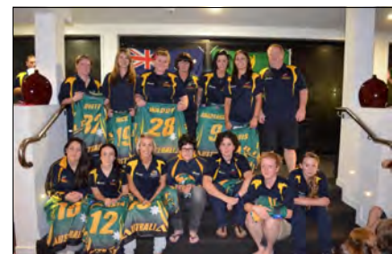
Masters: (5-3)(0-2)(3-2)(5-2)(7-5) NZ