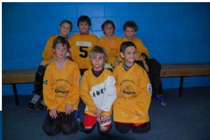
Junior Titans sponsored by: