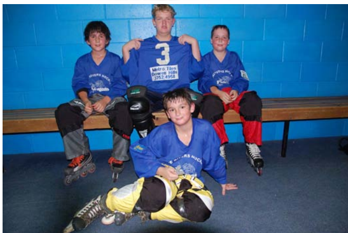
Junior Hawks sponsored by: