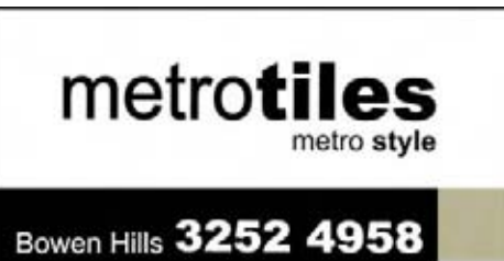
Sponsors of Intermediate Hawks”