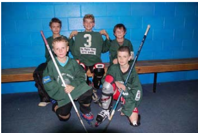
Sponsors of Junior Vikings