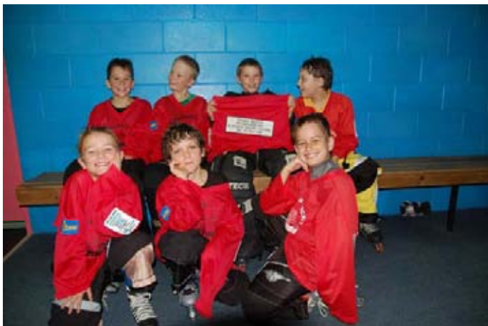
Junior Warriors sponsored by: