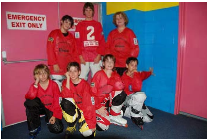
Intermediate Warriors sponsored by: